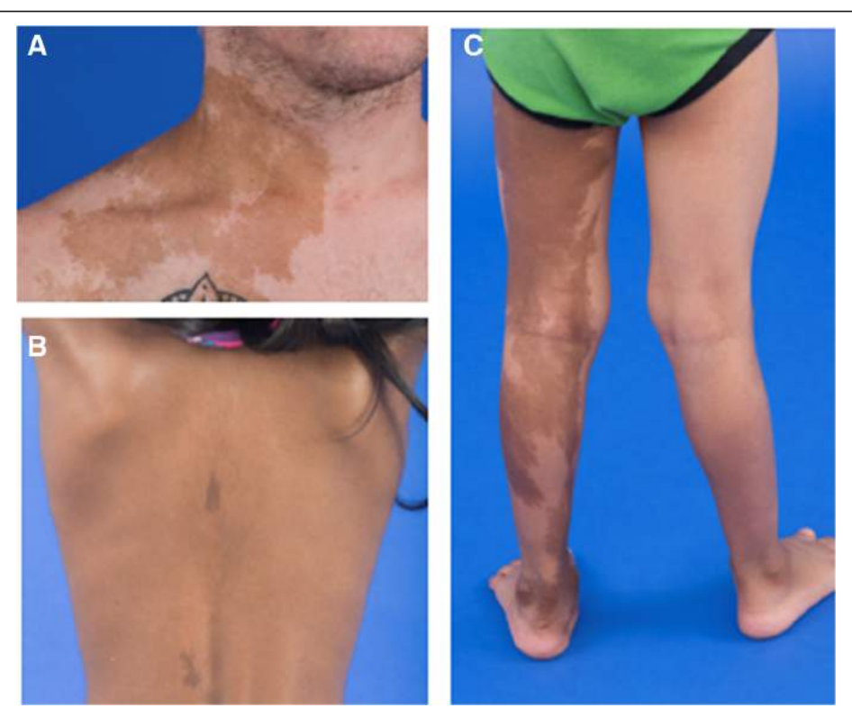
Fig. 1 Representative images of café-au-lait macules in patients with McCune-Albright syndrome. Photographs of the shoulder (a), back (b), and legs (c) from three patients demonstrating characteristic hyperpigmented lesions with jagged borders, and tendency to either occur or reflect around ("respect") the midline of the body. Images A and C show large lesions, while the patient in image B has two small lesions in a classic location, demonstrating the broad potential spectrum of involvement